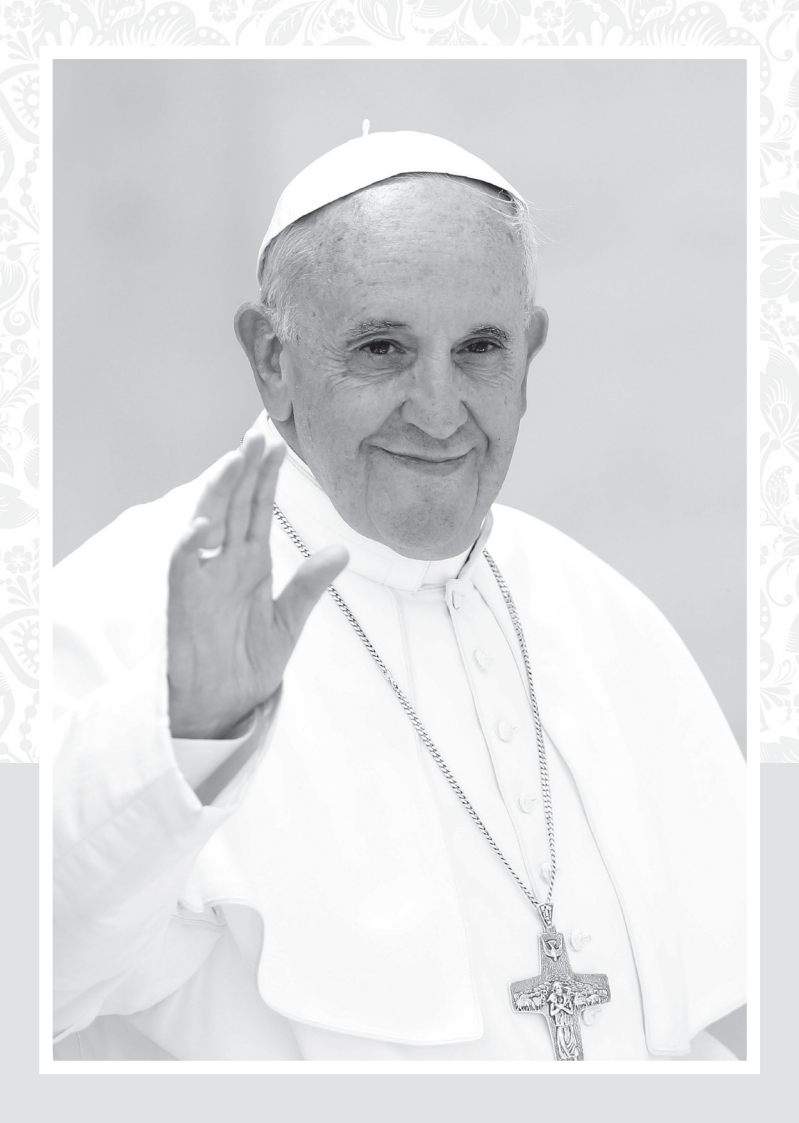
THE APOSTLE OF MERCY HIS HOLINESS POPE FRANCIS